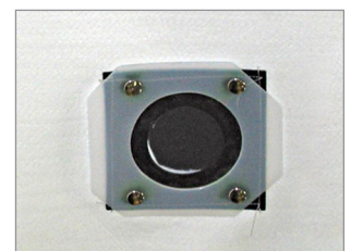
FILTER BAG WITH SAFETY VALVE FOR DISPOSAL