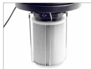
HEPA CARTRIDGE UPSTREAM H14 12.000 CM 2