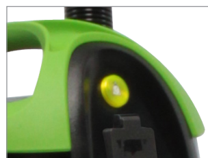
WARNING LIGHT FOR SPEED CONTROL > 20M/S