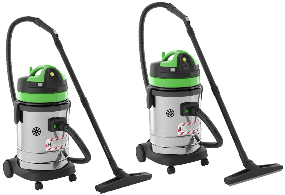
GS 1/33 H